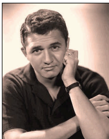
Just Jazz Artist of the Month singer-pianist Buddy Greco